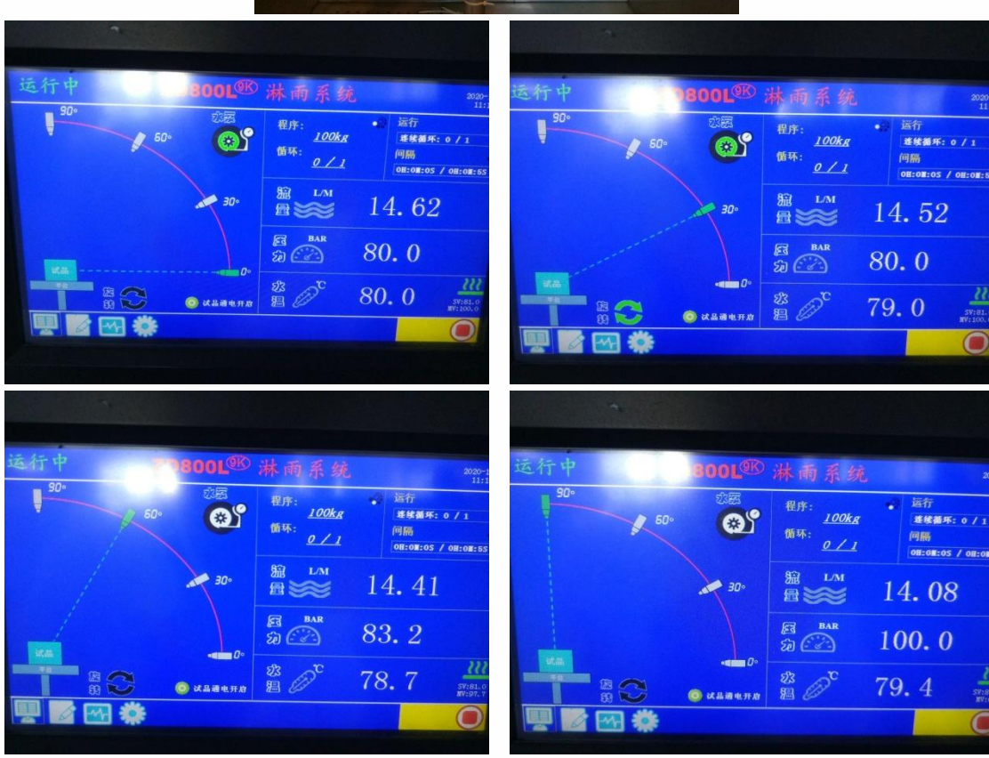
Test Set-up Photo